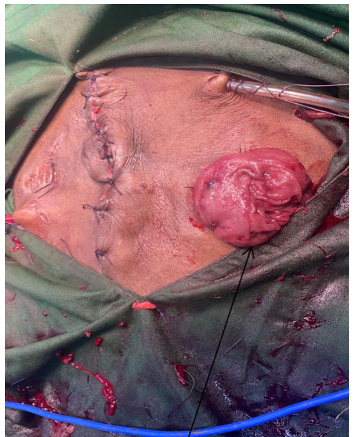
Figure 4: Intraoperative image of a double of the sigmoid colon and the transverse colon