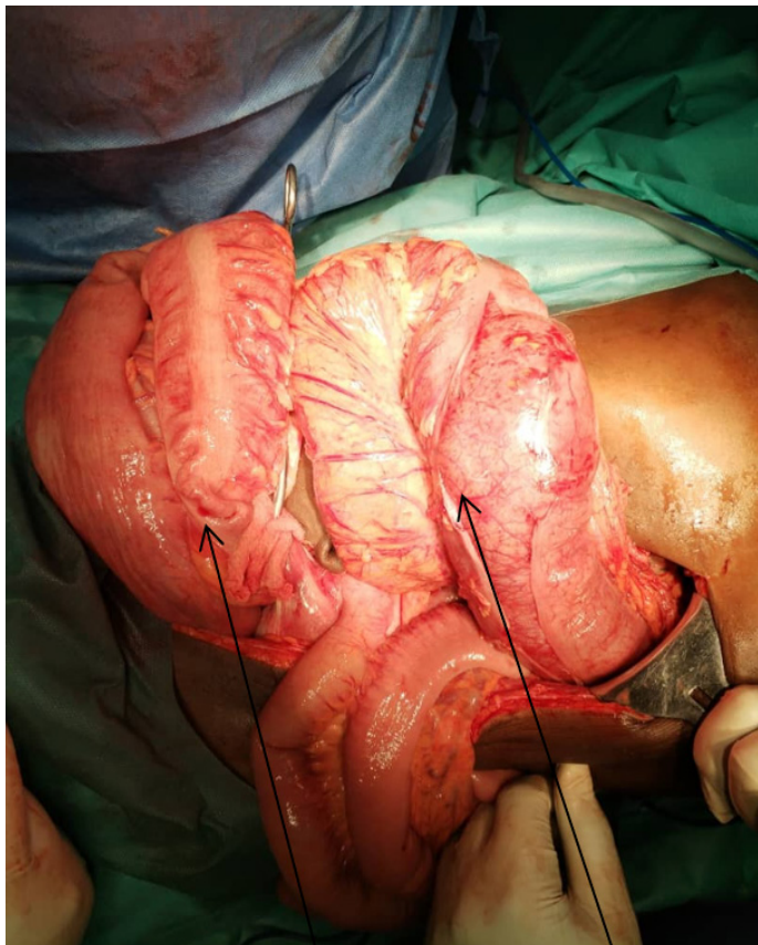
Figure 3: Intraoperative image of a double volvulus