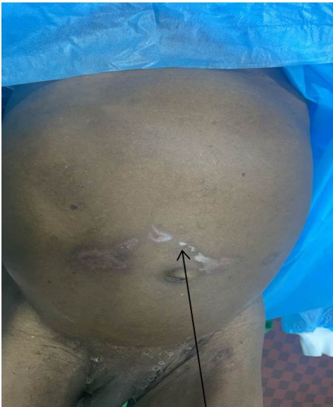
Figure 1: Abdominal asymmetry with peri-umbilical scarring